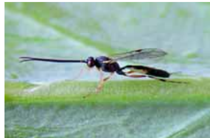
. . .and its enemy, the wasp

Control of the moth has remained a tricky issue. This completely cosmopolitan pest, which tolerates the tropical, subtropical and temperate climates, extending as far north as the Arctic Circle in Europe, is notorious for developing pesticide resistance. In Kenya and the East Africa region, ICIPE, the International Centre for Insect Physiology and Ecology, is making great strides in the control of the moth as part of the Centre's research into the pests of staple food crops and horticultural crops. ICIPE is working with partners to develop Integrated Pest Management strategies