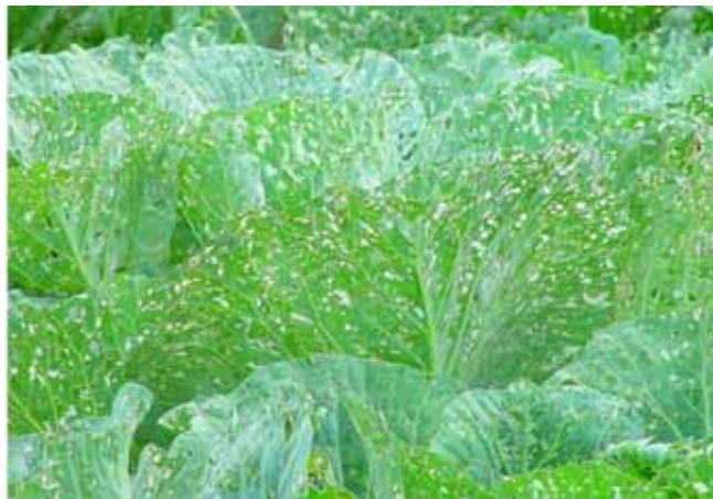
Nothing left to harvest: Infested cabbage