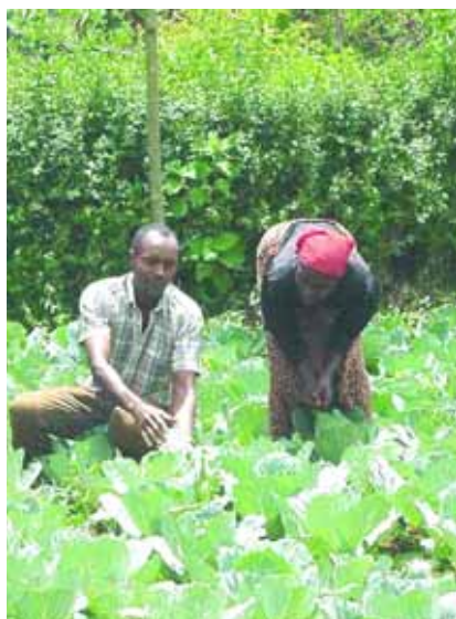
Releasing wasps in the field near Karatina

enemies), which are a major feature of Integrated Pest Management. The project commenced with a survey in the major cabbage growing areas in Kenya, Uganda and Tanzania, which showed that existing enemies were not providing a big enough impact in control of the Diamondback Moth. ICIPE therefore imported an exotic parasitoid, a parasitic wasp ( Diadegma semiclausum ), already being used in a number of countries in South East Asia (Taiwan, Indonesia, Mainland China). The wasp stings the Diamondback Moth larvae, lays its eggs, which hatch into larvae, which feed on the internal organs of the moth causing death. The wasp's larva pupates in a cocoon inside the loosely