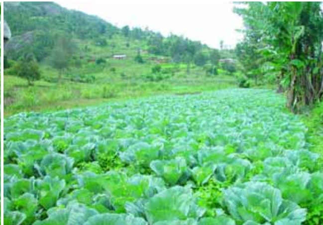
Cabbage crop 2 years after releasing wasps