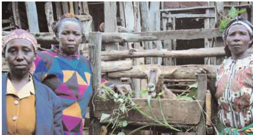
Kunyotoka Group members at their goat demonstration shed.