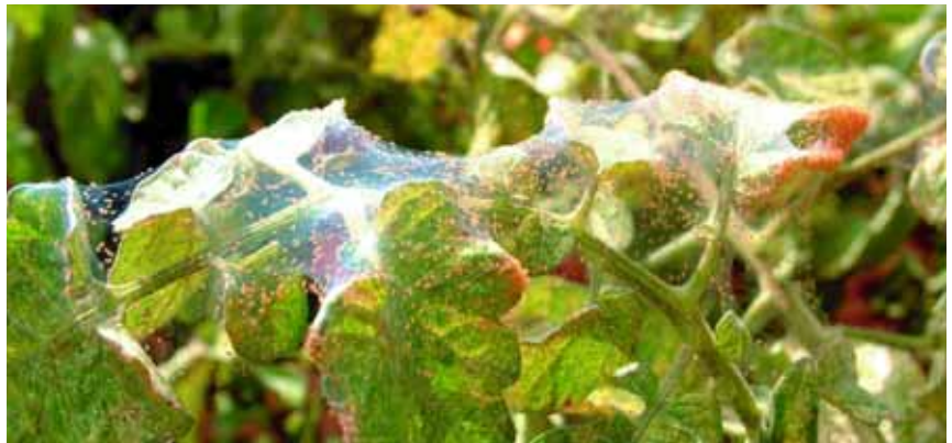
Spider mite web on a tomatoe plant. The red points on top are female adult mites waiting to be blown by the wind to the next plant for getting more food.

The two most important spider mite species (types) in Kenya are the tomato red spider mite and the two-spotted spider mite. The tomato red spider mite is not native to Africa. It