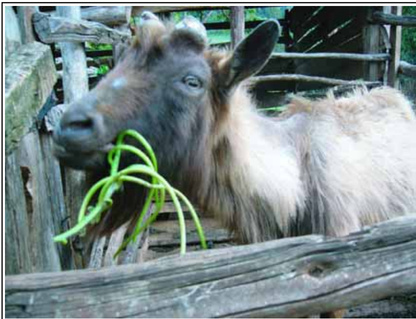
Dairy goats are becoming popular with many farmers, page 4,5

The newspaper for sustainable agriculture in Kenya Nr. 6 Sept./Oct. 2005