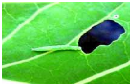
Larva of Diamondback moth. . .

Various factors have contributed to the low yield and returns, the most important being insect pest damage, which can lead to up to 100% loss if not controlled. One of the cabbage's major devastating pests is the Diamondback Moth ( Plutella xylostella DBM), a small greyish-brown insect which gets its name from